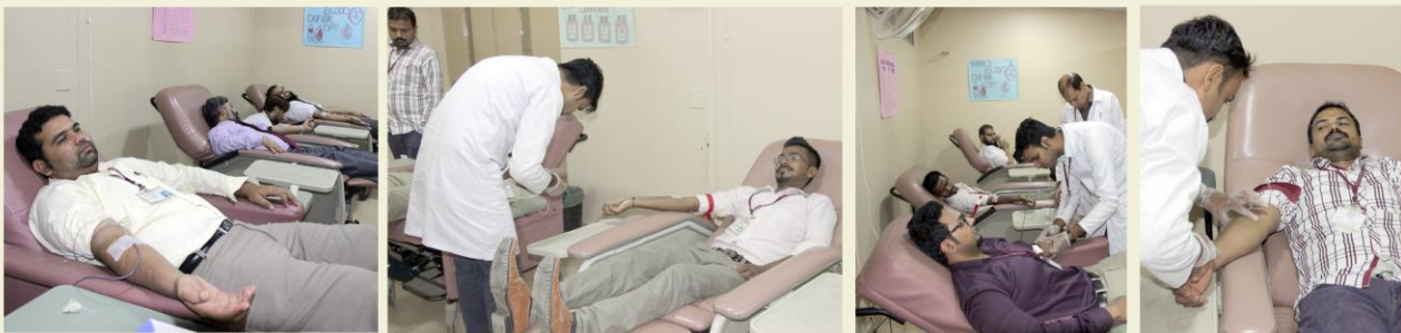
AUGUST, 07TH 2017 NA Patients were facilitated.