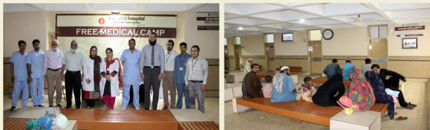
august, 12TH 2017 57 Patients were facilitated.